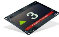
EAZ-TFT155 (7 INCH)