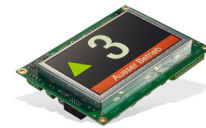
EAZ-TFT110 (5 INCH)