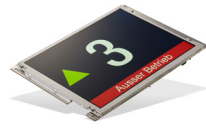
EAZ-TFT210 (10.4 INCH)